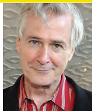
Playwright, Director, Screenwriter JOHN PATRICK SHANLEY