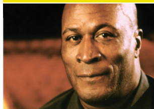
Actor JOHN AMOS